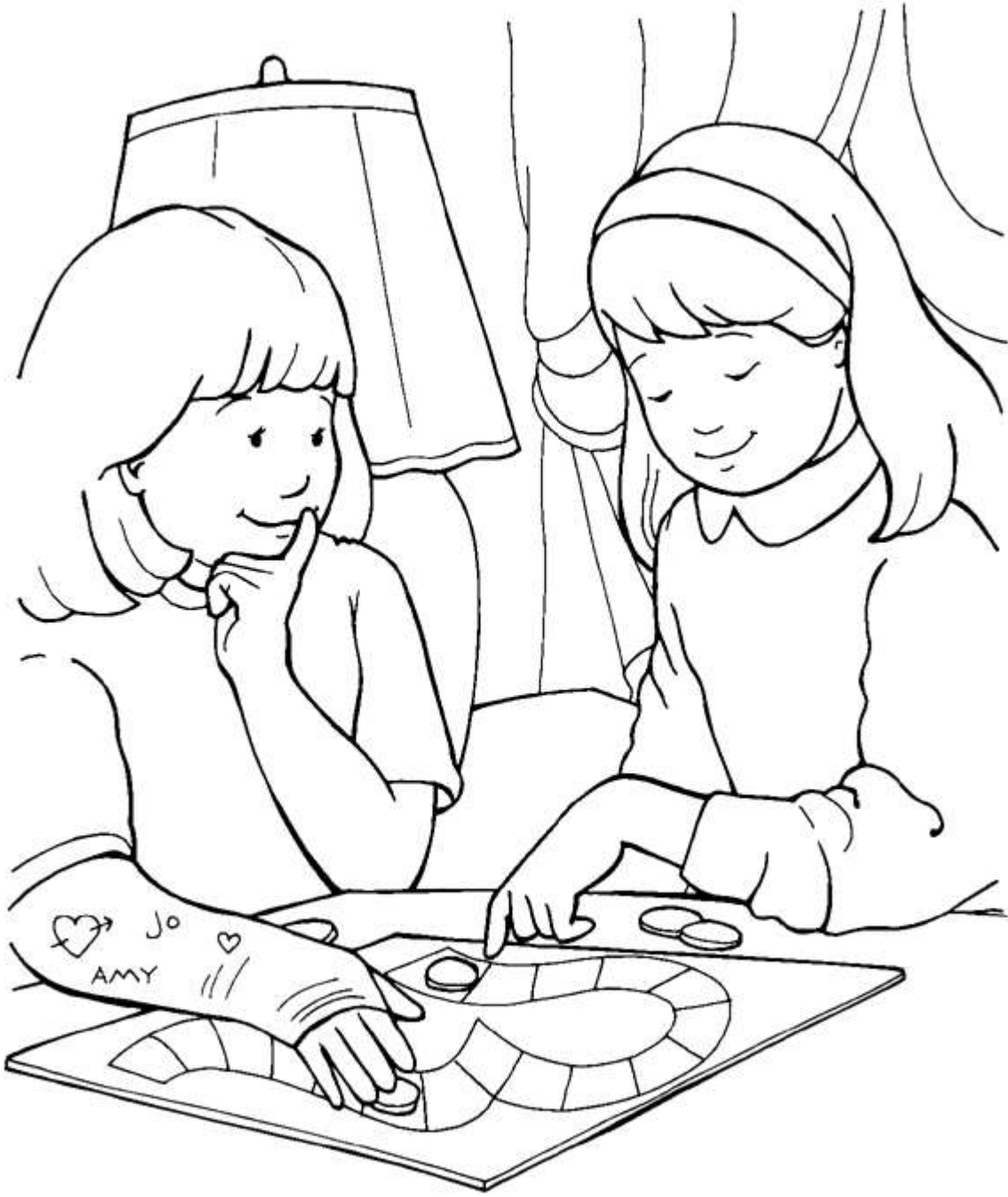
Showing Kindness Toward Others