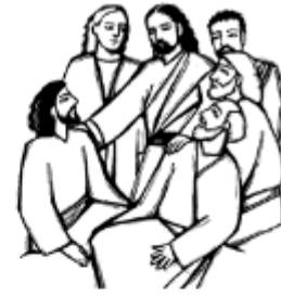
Calling the Twelve to him, he sent them out two by two. Mark 6:7 (NIV)

O J B B L Q D T U N I C Y H A S X H A O R R Y R C M B R L H T K L G B X O J G E Q L P C T A M B J O U R N E Y P R O Q M F V P R E A C H A J X E P R Q F I R P E C H H N E E N N L P M L K P V A W F O D U S J T M G L W W C K D S Q D S A U J A C A Y T T E A C H I N G O S W T G P A O E V I L S M O N E Y W E R K O T S P I R I T S Y S E L J E A U T H O R I T Y R T L H P J Q H E A L E D T K N P V F S A N D A L S O T M E W V E Q F Y N O T H I N G S Z Z X