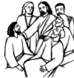
Calling the Twelve to him, he sent them out two by two. Mark 6:7 (NIV)